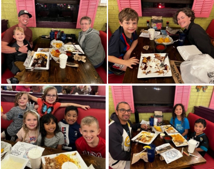
Spirit Night was a great success at Cantina Louie! Thank you, KES Families, for coming out and supporting us!