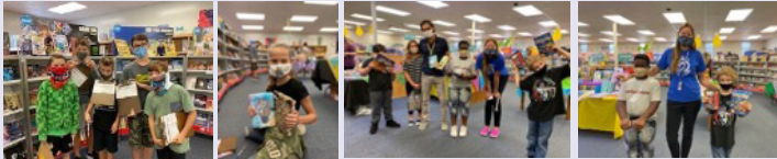
The Time Machine Book Fair was a great success! Thank you again to all the volunteers who helped make it happen.