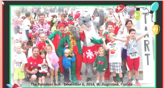
The Reindeer Run - December 6, 2014, St. Augustine, Florida