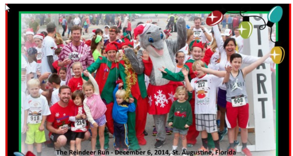
The Reindeer Run - December 6, 2014, St. Augustine, Florida

Happy Holidays from The Administration, Faculty, Staff and Students at Ketterlinus Elementary School Wishing a wonderful holiday and happy 2015 to all!